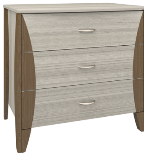
Model: LBCH30W 31.75W 20D 30H

Refreshing as the sea air its name represents, the streamlined Long Beach Collection's dual-toned look is the perfect match for any décor. Long Beach features chamfered side frames and front overlay design; extended tops provide additional space. The distinctive leg design has stylish dimensional appeal. The product is required to be wall mounted for safety. Using the kit provided, please follow provided instructions exactly.